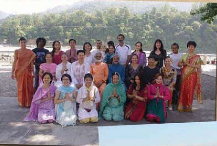
Parting With Fun

For Application form & Online registration please visit to www.yoga-rishikesh.com