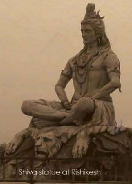
Shiva statue at Rishikesh