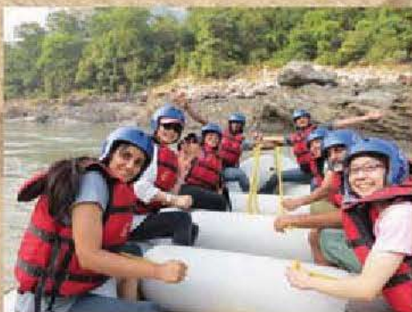
Rafting In Rishikesh