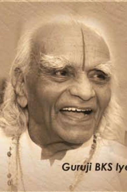
Guruji BKS Iyengar